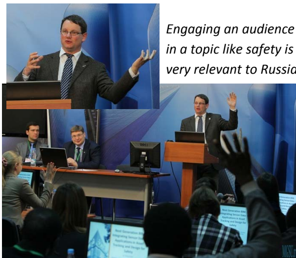
Engaging an audience in a topic like safety is very relevant to Russia