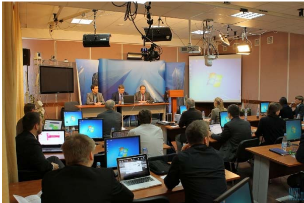
More than 50 attendees in a TV studio-like setting